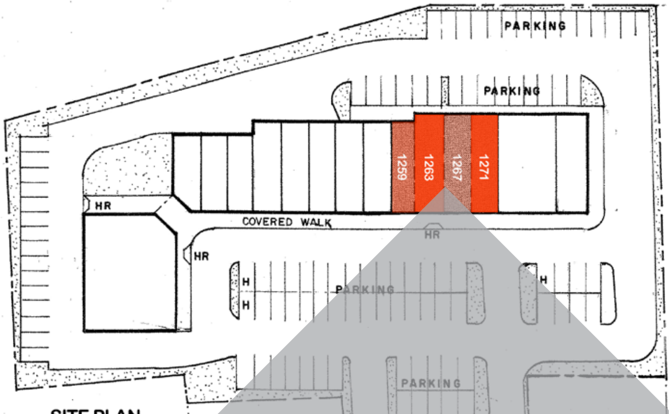
SITE PLAN LAKE KAHRYN PLAZA